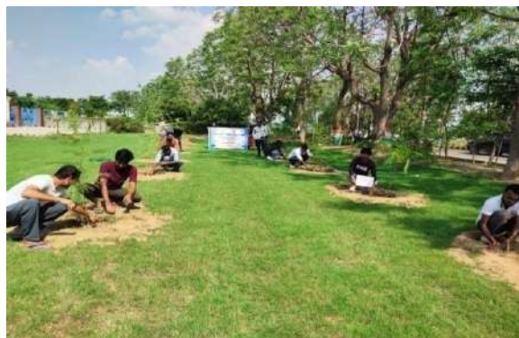
Plantation Drive in the Campus

The University has started drive to make the campus green and with this objective, plants of different varieties are planted every year. The University has launched ‘Green Graduate Programme’, where students will plant saplings upon joining the University. One star will be given on the final degree certificate and students will be awarded the title of Green Graduate. Recently, the University is awarded with prestigious Platinum Award by the Bharat Environment Programme- A Bharat Sustainability Campus Mission 2026