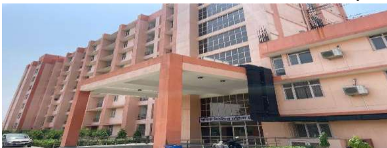
Bhagini Nivedita Women Hostel

The university has one Boys Hostel viz. Maharana Pratap Boys Hostel and One Girls Hostel viz. Bhagini Nivedita Women Hostel. The students may apply for the hostel separately and the Information Brochure for the same is available on the university website www.igu.ac.in